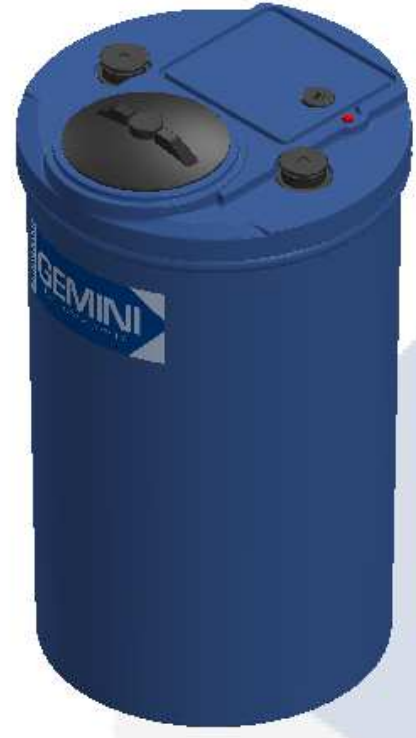
ISO VIEW (ASSEMBLED)