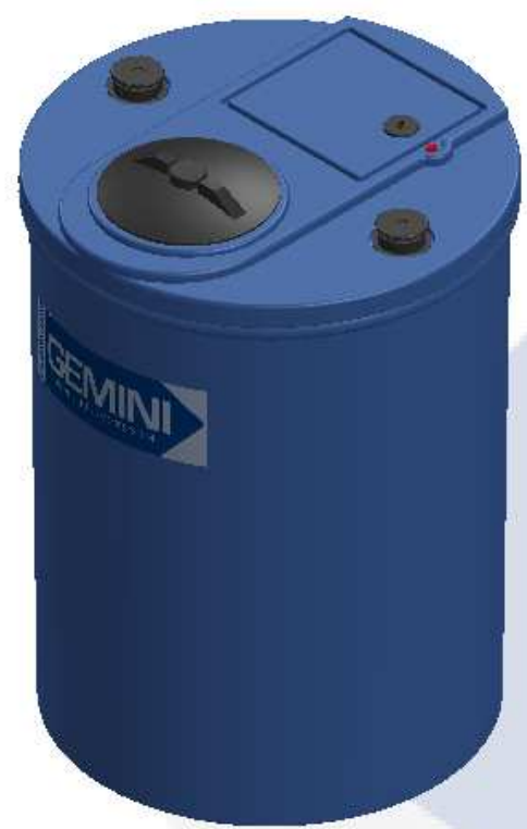
ISO VIEW (ASSEMBLED)