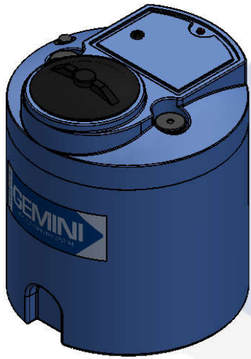
ISOMETRIC VIEW (ASSEMBLED)

ALTERNATE CONFIGURATION TO MEET NSF/ANSI STANDARD 61 AVAILABLE